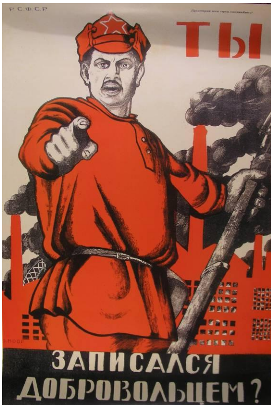
“Have you signed up as a volunteer?” D.S. Orlov Ed2008.1.4 (reproduction)

After the Civil War, Lenin instituted the more relaxed New Economic Policy (NEP), which temporarily allowed inequality in order to build up abundance. Lenin allowed the “acceptance of markets, commodities and pricing to woo peasants and improve the economy.” 13 The NEP period also allowed debate and discussion within the party and introduced limited cultural pluralism, leading to the Golden Age of Soviet Art. During this period, propaganda posters focused on the need to build a new world and way of life after the destruction of the Civil War, selling Communist ideology to the population by portraying the benefits to individuals, not just the State. Due to the freedom and exploration characteristic of the arts during this period, propaganda posters were drawn in many different artistic styles.